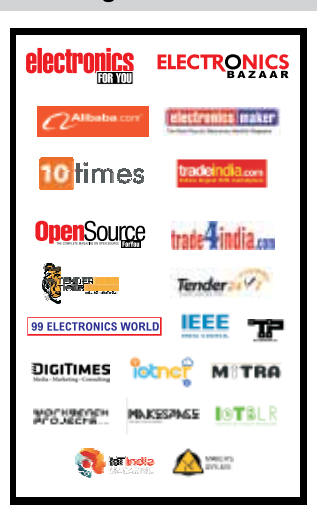
All product names, logos, and brands are property of their respective owners.